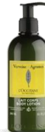
BODY MILK 300ml

This shower gel gently cleanses the skin while leaving it pleasantly scented with sparkling and fruity notes.