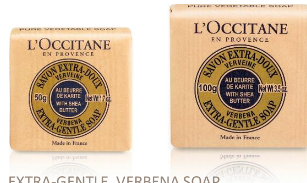
EXTRA-GENTLE VERBENA SOAP 50g & 100g

Inspired by the traditional recipe from the master soap makers, this soap is formulated with an extra-gentle plant origin base and is enriched with shea butter, known for its softening and protective properties.