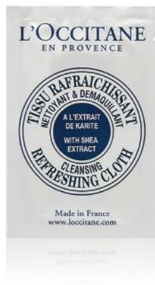
SHEA BUTTER MAKE-UP REMOVER CLOTH 4ml

An iconic ingredient that works its nourishing magic while taking your senses on a journey.