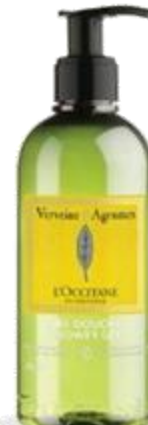
SHOWER GEL 300ml

This shower gel gently cleanses the skin while leaving it pleasantly scented with sparkling and fruity notes.