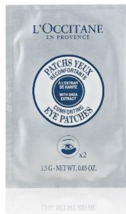
SHEA BUTTER EYE PATCHES 1.5g

With its fine and non-greasy texture, the Light Comforting Cream helps to lastingly moisture your skin. As protected against external aggressions, it stays comfortable all day long. Formulated with 5% shea butter, this face cream is an ideal skincare for normal to combination skin, even sensitive one.