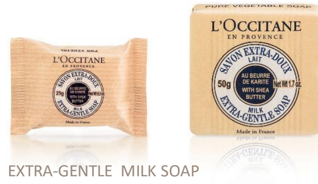
EXTRA-GENTLE MILK SOAP 25g & 50g

Inspired by the traditional recipe from the master soap makers, this soap is formulated with an extra-gentle plant origin base and is enriched with shea butter, known for its softening and protective properties.