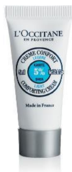
SHEA BUTTER LIGHT FACECREAM 5ml

With its fine and non-greasy texture, the Light Comforting Cream helps to lastingly moisture your skin. As protected against external aggressions, it stays comfortable all day long. Formulated with 5% shea butter, this face cream is an ideal skincare for normal to combination skin, even sensitive one.