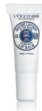
SHEA BUTTER LIPBALM 4ml

With a formula enriched in shea extract, these eye patches are perfectly adapted to the eye contour. They provide comfort, softness and a refreshing sensation. The hydrating ingredients are released for an instant soothing effect and restful-looking eyes.